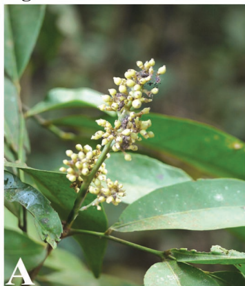
A - Glycosmis pentaphylla