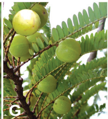
Fig.1. Mandal et al. :Ethno-...India.