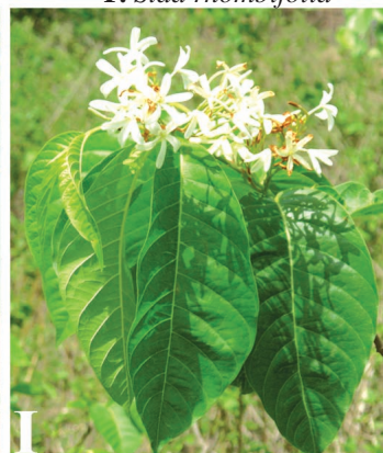
I . Wrightia antidysenterica