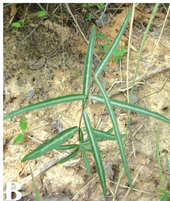
B . Hemidesmus indicus