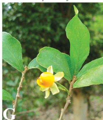
G . Streblus asper