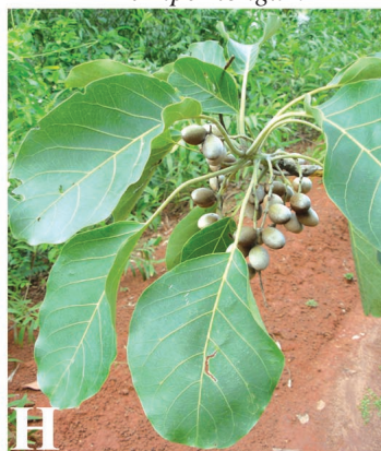
H . Terminalia bellirica