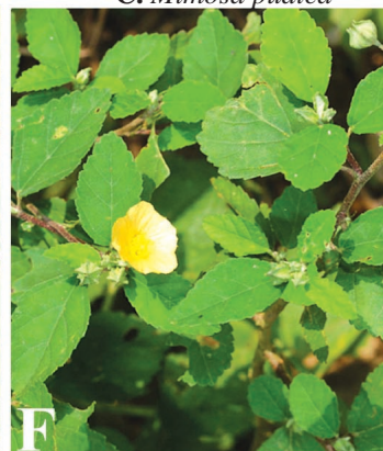
F . Sida rhombifolia