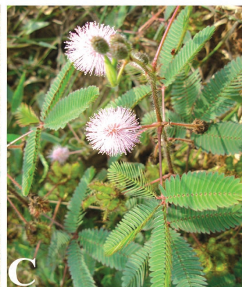
C . Mimosa pudica