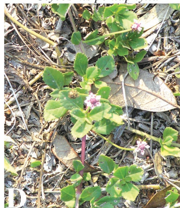
D . Phyla nodiflora