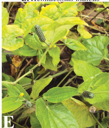
E . Piper longum