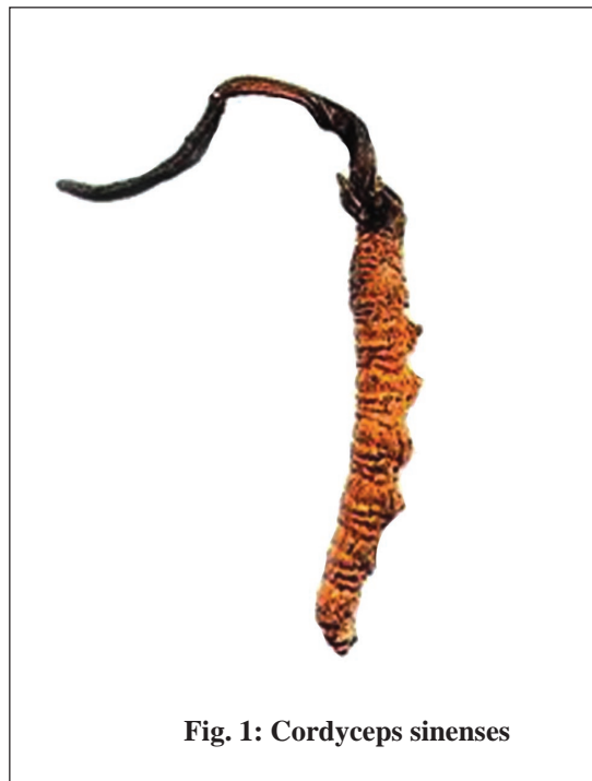
Fig. 1: Cordyceps sinenses

The fungus is endemic to the Himalaya and the mass collection throughout its distributional ranges (India, Nepal, Bhutan and Tibet) puts it in the category of threatened plants. In India no regulations and legislation control the collection, trade and export of C. sinensis has been seen and the fungus is not in the Negative List of Export. However, the neighboring countries, like Nepal and Bhutan have forced some rules and regulations at Govt. level regarding the collection of this organism ( http://www.mope.gov.np ; Maity 2010). Fortunately, the alpine habitat of the fungus have been brought under different protected areas under Protected Area Network (PAN) programme of India, viz. Nanda Devi Biosphere Reserve in Uttaranchal, Kanchenjunga Biosphere Reserve