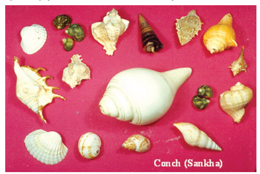
Fig.2 : Photograph of Sankha (Conch) and different conch shaped creatures.

appearance of gastric lesions induced by pylorus ligature (Table 2). The pepsin secretion was also significantly inhibited by SBM. Further, SBM was able to reduce the gastric volume (21% and 61%), free acid (29% and 53.7%), total acid (24.3% and 45%), and pepsin (47.9% and 59.7%) concentrations significantly when compared to control in pylorus-legated rats (Table 3). The results were almost same as in the case of standard drug, ranitidine at 50 mg/ kg. Ranitidine inhibited gastric lesions (60.5 %) and also reduced the gastric volume (56%), free acid (52.6%), total acid (49.4%) and pepsin (69.6%). Further, SBM pretreatment showed increment in pH level (32.6% and 69.7%) and mucin concentration (26.7% and 37.5%) in the gastric juice of pylorus-ligated rats than vehicle treated control (Table 3). However, reference