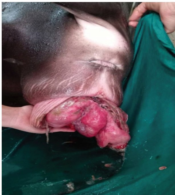
Fig. 1. Prolapsed mass with cervical tear.