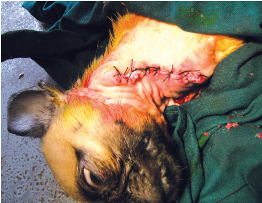
Fig. 6. Showing sutured skin after removal of the mass.

The standard surgical approach for the head and neck cancers is excision of the primary lesion, followed by sampling of the periphery of the resultant defect with multiple intra-operative frozen sections to ensure complete removal of the tumour. The most important prognostic factor in patients with head and neck squamous cell carcinoma is the completeness of surgical removal of the tumour (Snow 1989).