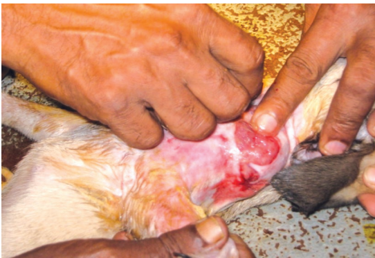
Fig. 3. Showing ulceration of skin over the tumour.