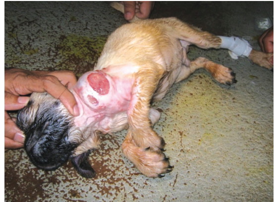
Fig. 1 & 2. Showing the site of tumour in two dogs.