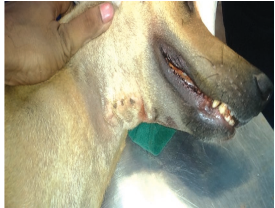
Fig. 7. Showing the site after 21 days of operative procedure.

Gandour-Edwards RF, Donald PJ, Lie JT (1993) Clinical utility of intraoperative frozen section