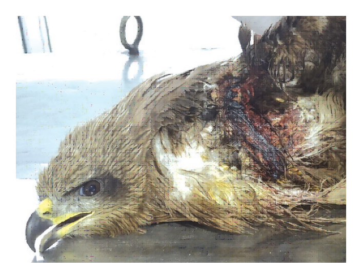
Fig. 1. Black Kite ( Milvus migrans ) presented with compound fracture in the left wing.